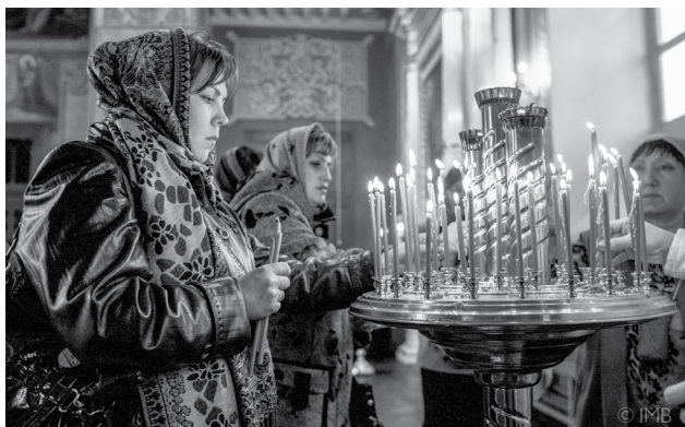
FEB. 23 Praise, protection and resilience for ministry friends in Russia, Ukraine and Belarus

3 Please pray today for churches receiving listener information from RTM!